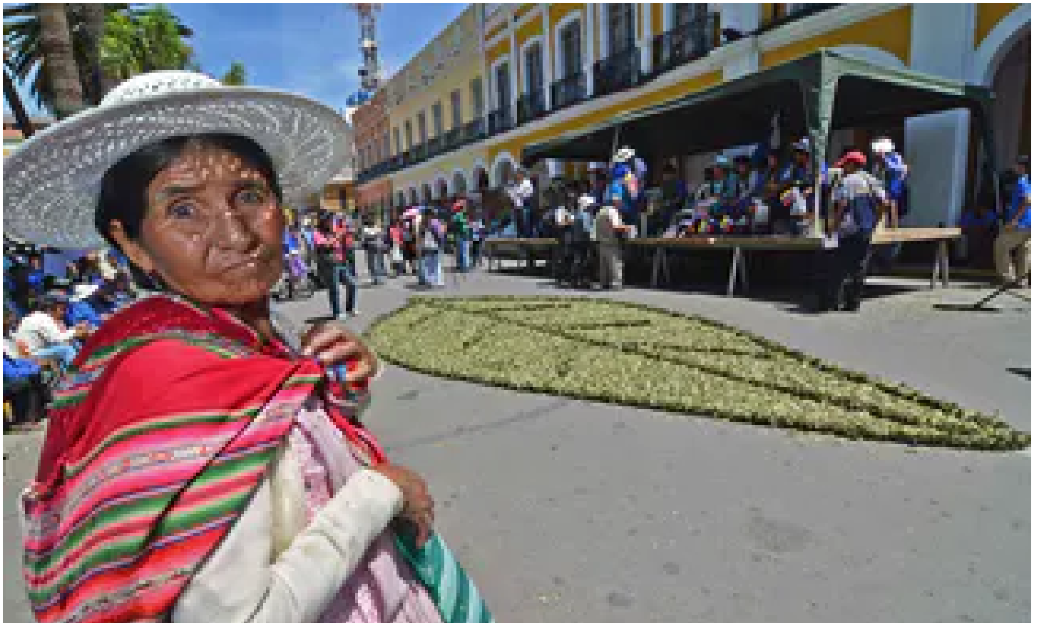
How Bolivia curbed coca production by moving away from violent crackdowns