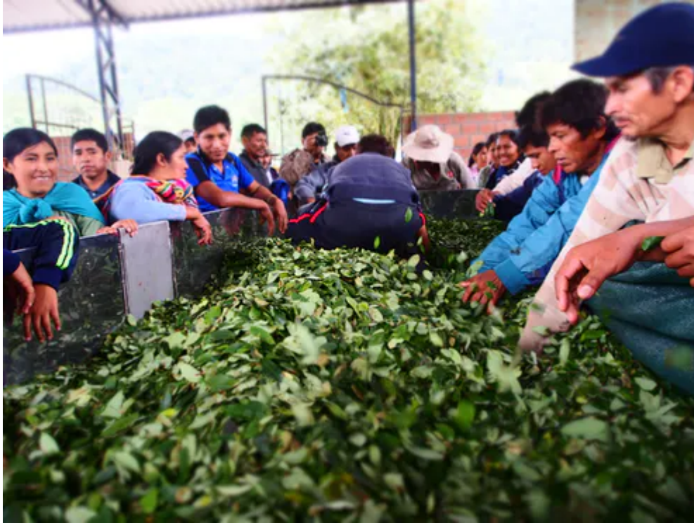
Drying coca, Chapare, Bolivia