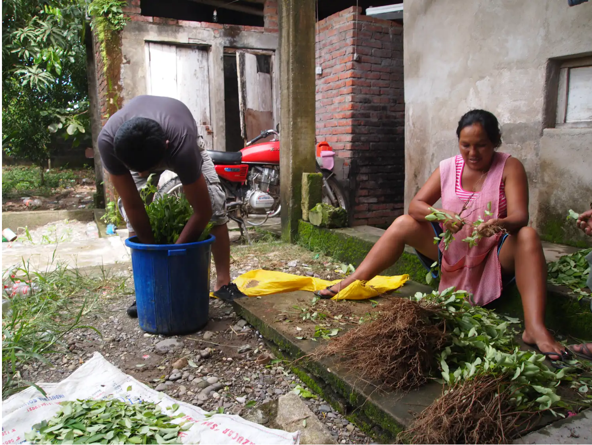
Farmers prepare coca seedlings.