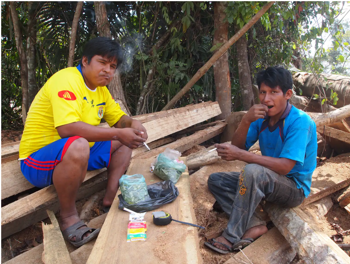
Two workers take a break to chew coca, Chapare, Bolivia.

By recognizing coca cultivation as a legitimate source of income, the [Bolivian] government has helped stabilize household incomes and placed farmers in a better position to assume the risk of substituting illicit crops with alternative crops or livestock.