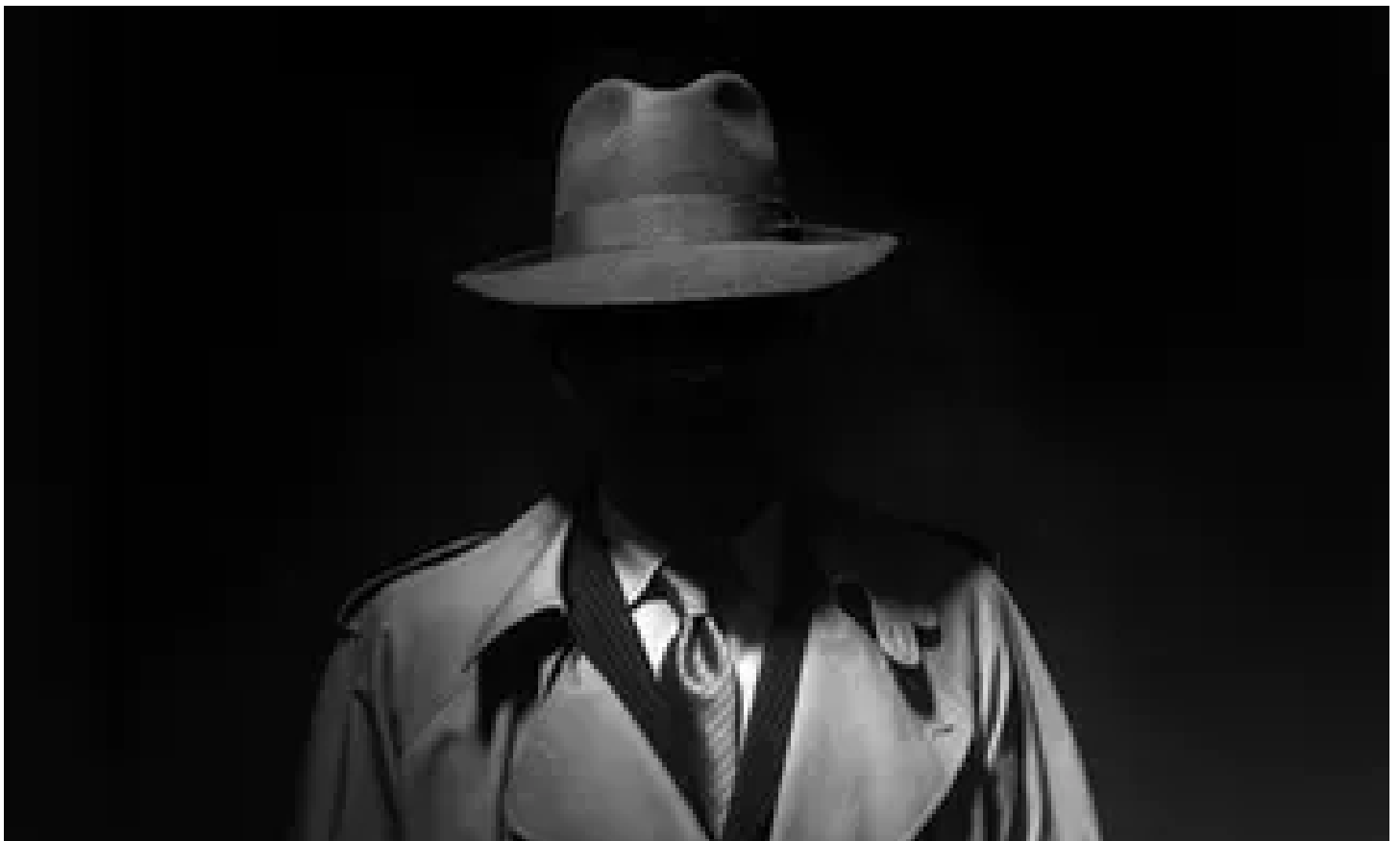
Albanian mafia: the dangerous myth that distorts our view of the global drugs trade