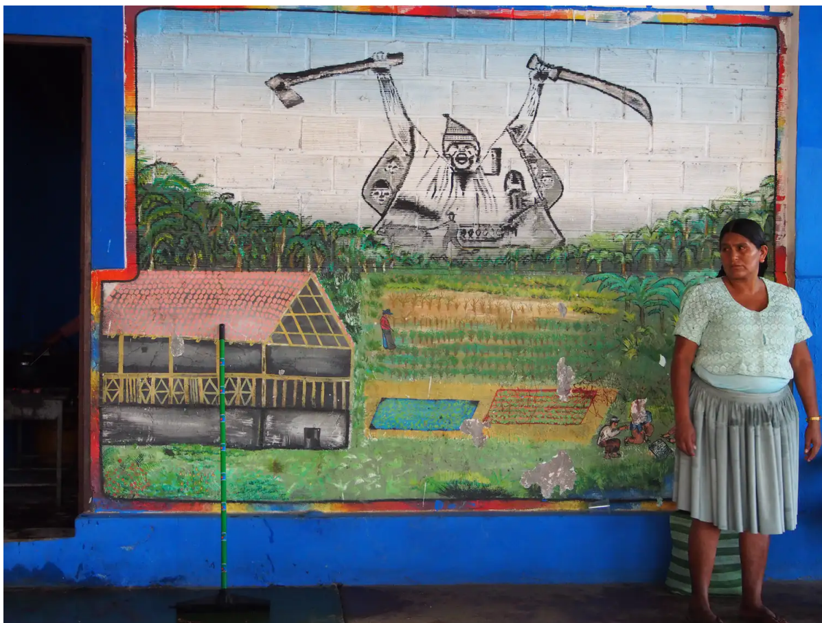
A woman stands in front of a mural depicting coca growing. The Chapare, Bolivia.

These negative outcomes have stimulated regional debate around the violence, corruption and instability fuelled by current drug policies. Bolivia has emerged as a world leader in promoting a new model based on farmer participation and non-violence.