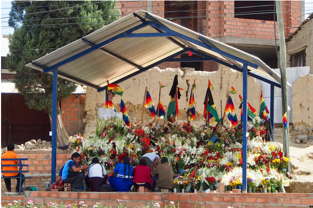
A memorial for the nine coca farmers killed in November 2019, Cochabamba, Bolivia.

The trust that coca growers once had in government has evaporated, and with it the underpinnings of community control. This holds an important lesson. If a government continues to treat coca growers as enemies – people whom policies should act upon rather than collaborate with – then the violence, failed development and coca cultivation will continue unabated.