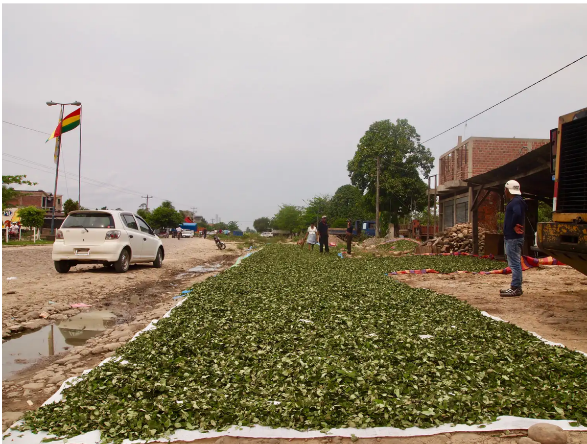
Coca left to dry in the street, Chapare, Bolivia.