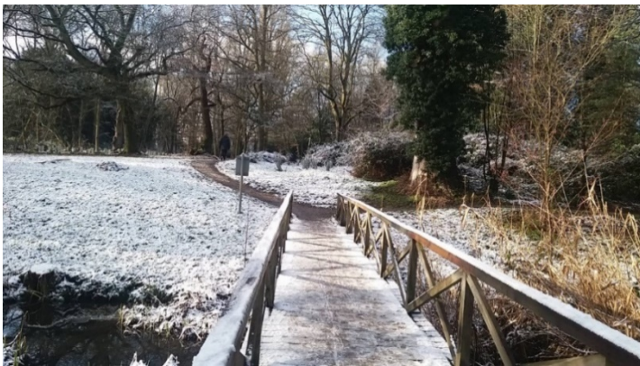
Snowy Wilderness, Whiteknights Campus

The Department of Meteorology is organised over several buildings on the Whiteknights Campus, The Meteorology building WO58, the Harry Pitt building WO56, and the Philip Lyle building WO32.