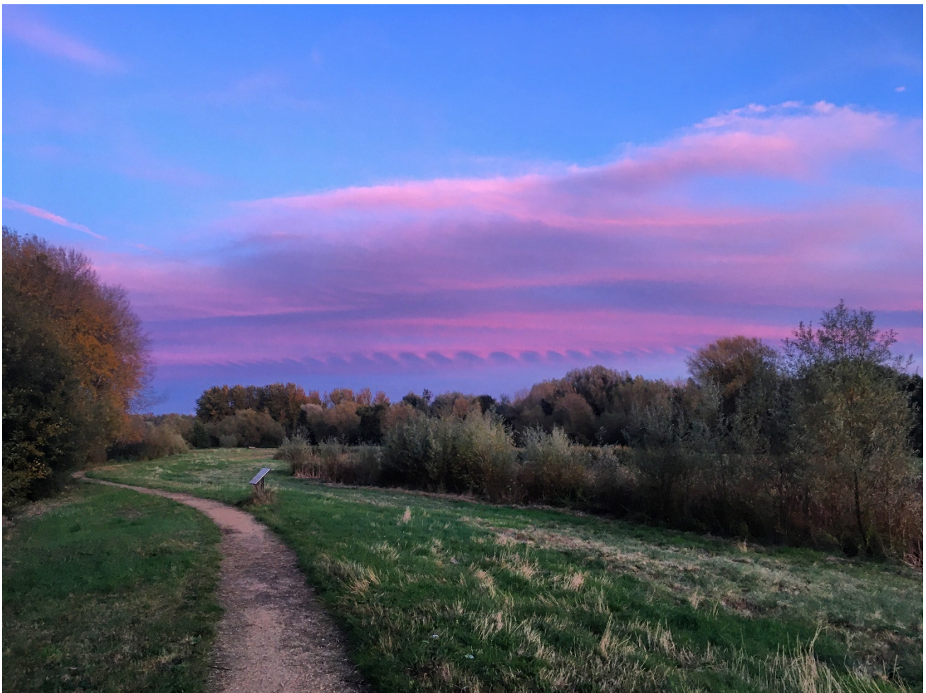
Fobney Island nature reserve, Reading 13th October 2019 –Kelvin-Helmholtz instability waves.