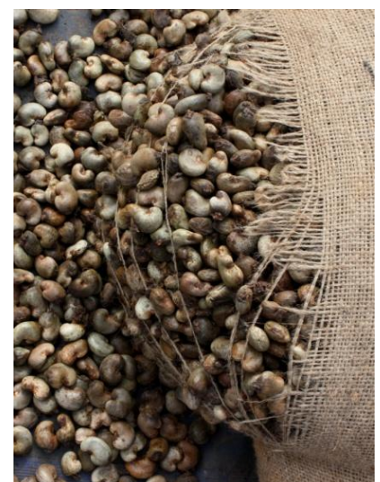
Raw Cashew Nuts being dried in Brong-Ahafo region, ready for export.

This participatory research study involved 60 people from the Jaman North district of the Brong-Ahafo region and key stakeholders working at national and international levels. A diverse group of men, women and young people participated.