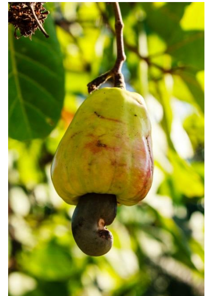
Cashew nuts growing on a tree - this extraordinary nut grows outside the fruit, called a cashew apple.