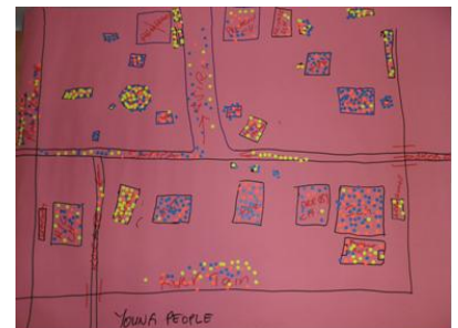
Young people's participatory map of the rural community