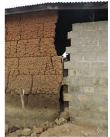
Renovating homes with the income from cashew production

The expansion of cashew plantations on family lands is leading to increased land disputes, with wealthier farmers encroaching on the land of poorer farmers and exacerbating both gender and class inequalities.